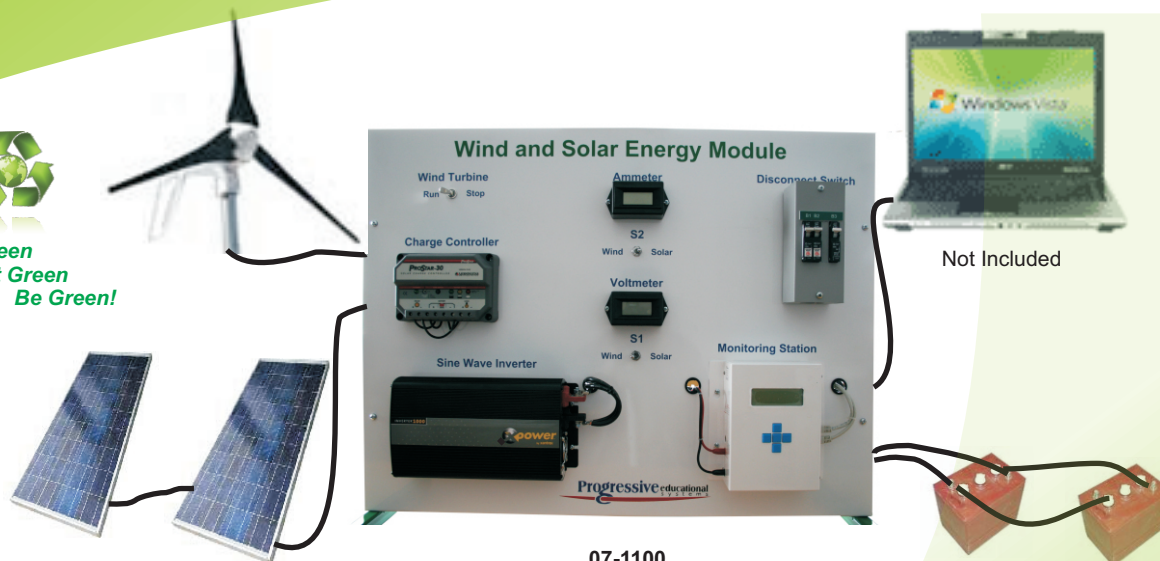
07-1100 Wind and Solar Energy Module